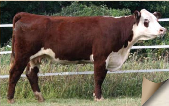
Lot 30 — LAKE 002 Ella 225R