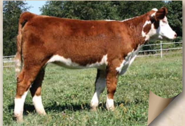
Lot 31A — PRR BMK Fabulosity 38U