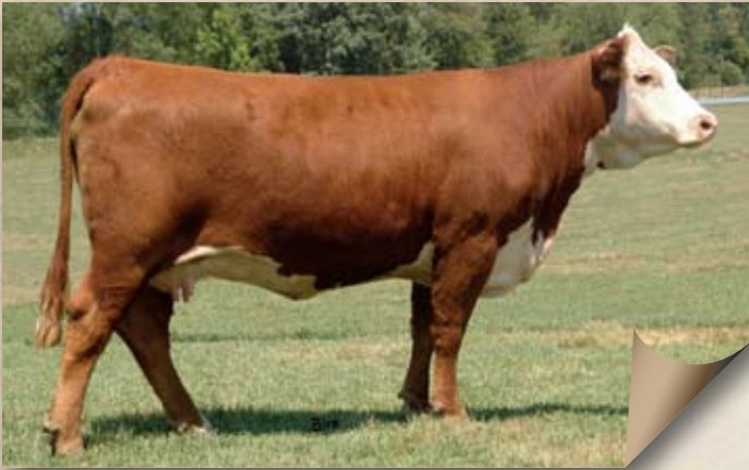
Lot 29 — JPF K29 Markette R5