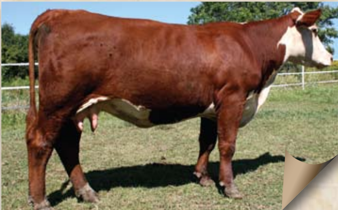
Lot 32 — PRR 175M Liza 10R

BW 3.0; WW 44; YW 71; MM 20; M&G 42; FAT -0.03; REA 0.28; MARB -0.12