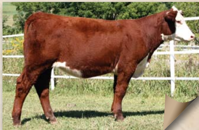
Lot 17 — PRR Rhapsody 26U