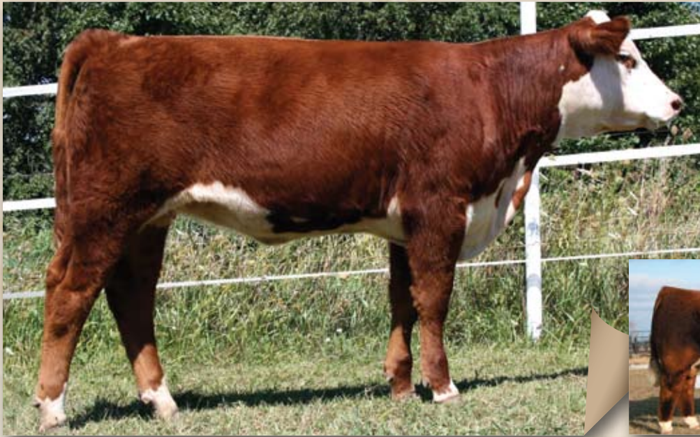
Lot 1 — PRR 80P Rebecca 1U