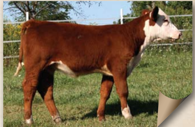
Lot 32 — PRR LADY IN RED 46U