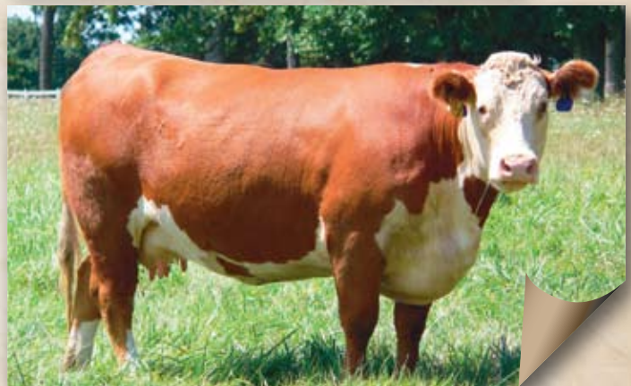
Dam of PR 279R First Blood 7031 ET — PR 59J Lass N57

BW 4.9; WW 67; YW 107; MM 14; M&G 47; FAT 0.03; REA 0.84; MARB -0.07