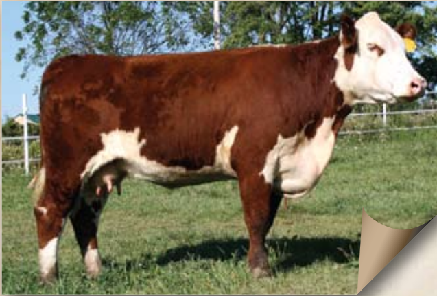
Lot 33 — PR 313K Deana 13S