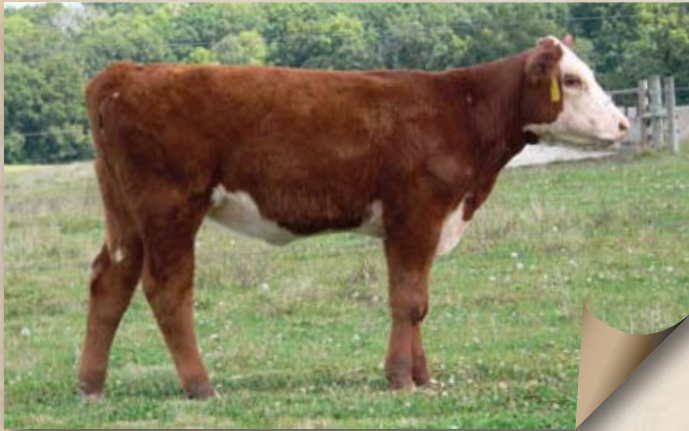
Lot 10 — PR 80P Leslie 8006