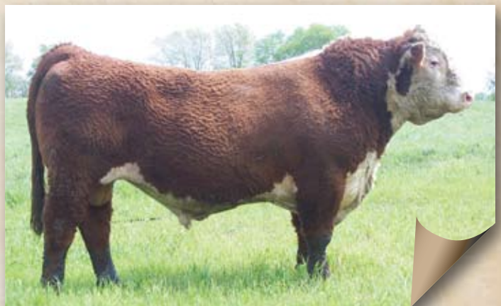
Sire of Lot 55 — CH Enuff Prophet 2913