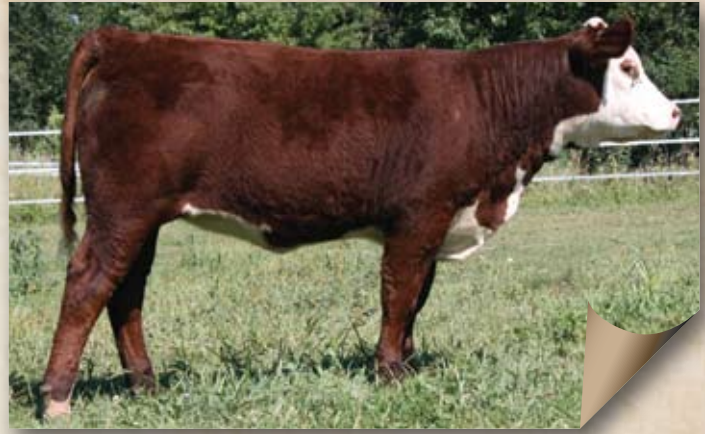
Lot 27A — PRR MRK Sweet Tart 2U

BW 5.6; WW 44; YW 74; MM 13; M&G 35; FAT -0.01; REA 0.28; MARB -0.08