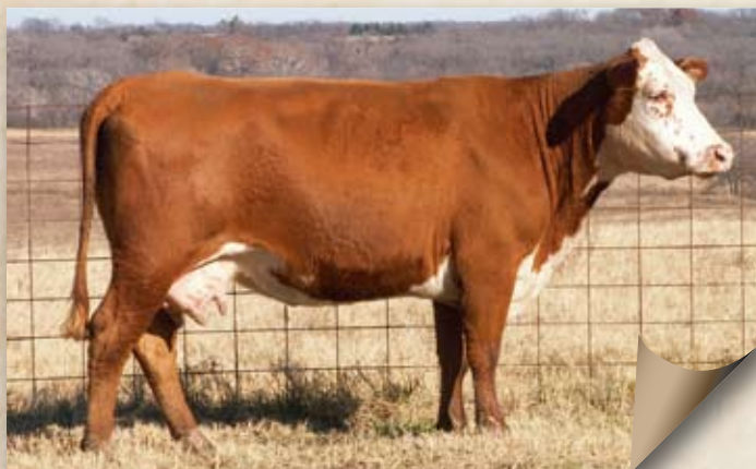
Lot 37 — HH Miss Advance 1130L

We have decided to sell the majority of our fall calving group. Conditions and facilities make it difficult for us to manage a second group. This gives you an opportunity to select from a real nice group of cows and make some quick cash next summer. Many of these will have calved by sale day.