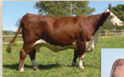
Dam of Lots 20A & B — Dunwalke Pris E114

BW 3.9; WW 42; YW 74; MM 18; M&G 39; FAT 0.00; REA 0.55; MARB -0.01