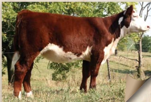
Lot 26A — PRR RMK Herfelicious 11U