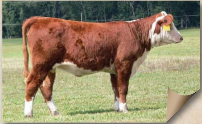
Lot 6B — PR 279R Annette 8034 ET

DUNOON PAGE ET1 LCI RED HAVEN ET 112A BP 42B LAD ET 267F BP LADY DOMINO 213E