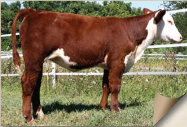
Lot 9 — PRR 553 Cinderella 33U