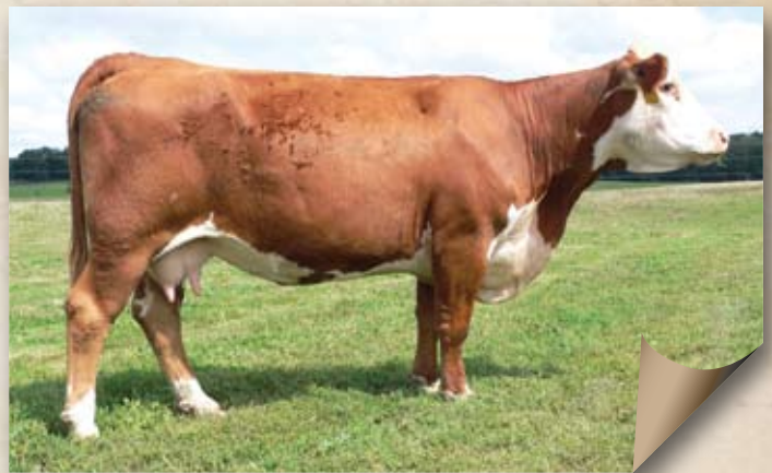
Lot 48 — PR 59J Lass M26