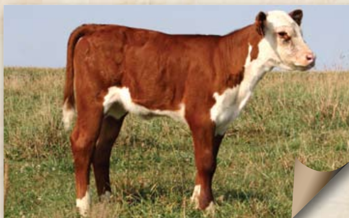
Lot 38A — PRR CARLINA 8971U