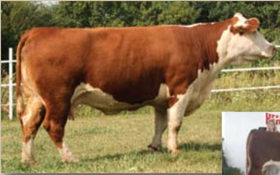
Lot 31 — STAR SS Bethany 9M