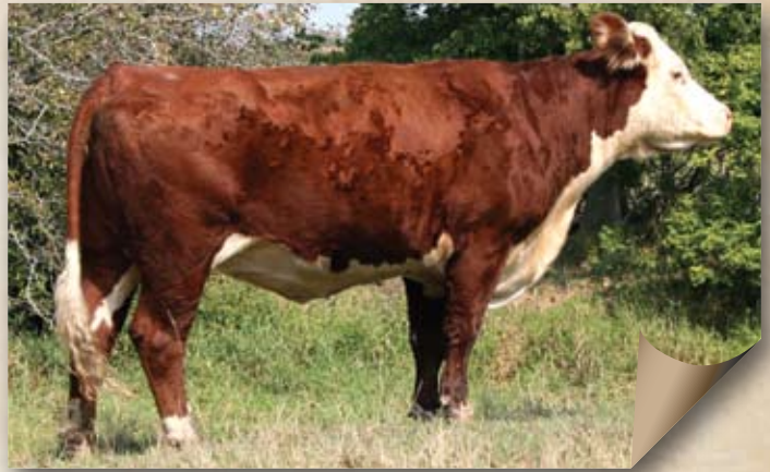
Lot 40 — PRR 57H Hannah 44R ET