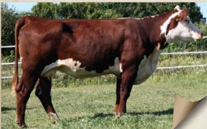
Lot 26 — DCC H 125L Jessica 5039