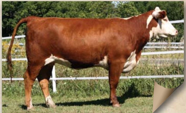
Lot 41 — TRM 1004 Samara 6137