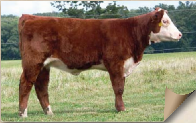
Lot 3 — PR 80P Regina 8020