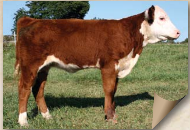
Lot 33A — PRR EXCITE ME 48U