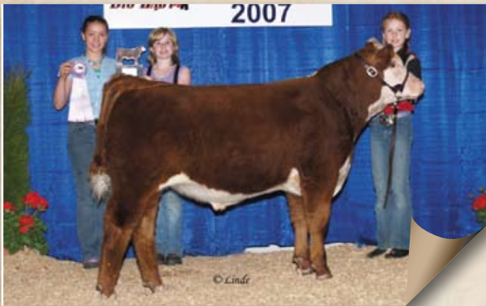
Service Sire to Lot 43 — TLR Hot Shot