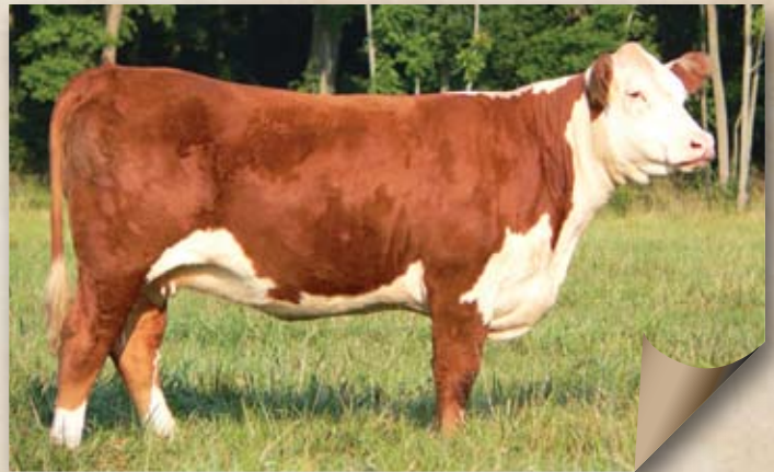
Bred heifer out of GEF 552 Dominette 2210