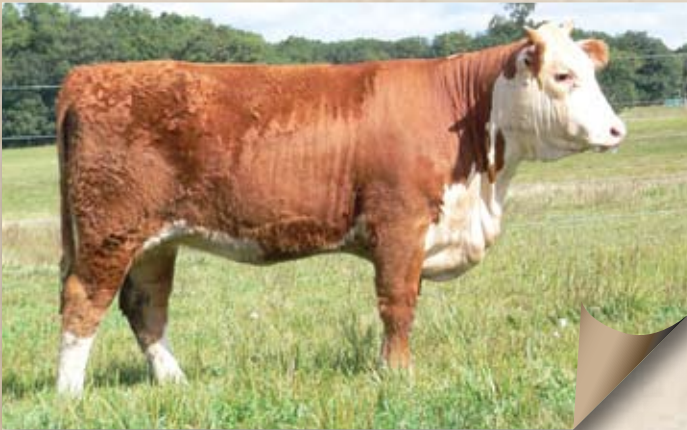
Lot 19 — PR 279R Rosemary 7029