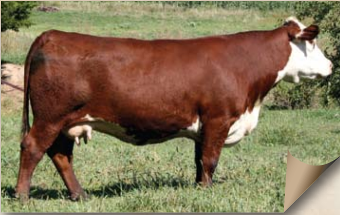
Lot 27 — MB 76K Emotion 219M