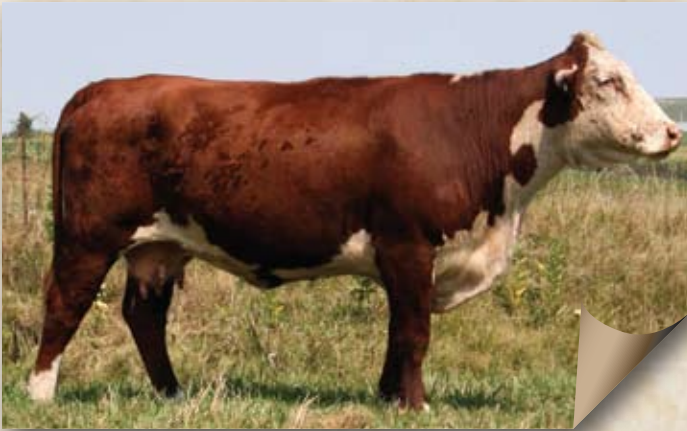
Lot 28 — BPH 8146 Penny 103