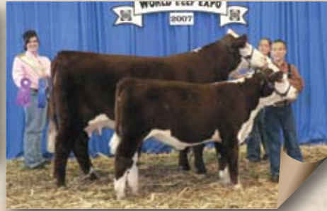
OHR Fantasia 85L 53R