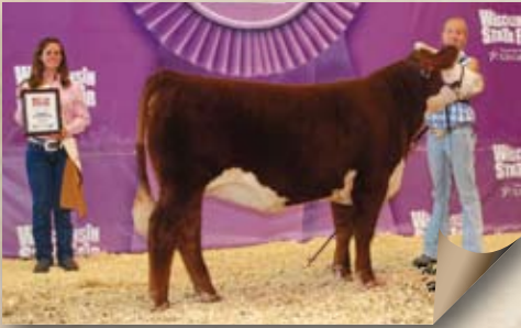
STAR TRF Loaded Lady 315T

• An opportunity to flush from one of these 4 females.