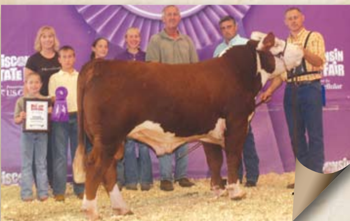
Service sire to Lot 45 — CLF GCC Cutter T227