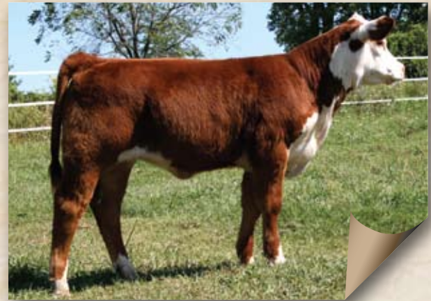
Lot 34A — PRR COUNTRY GAL 51U