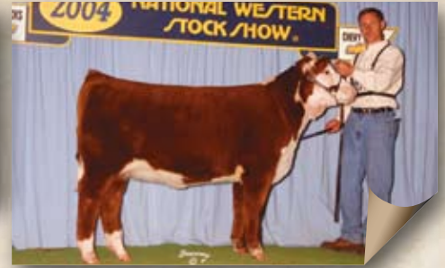
LAKE MSU 002 Ann 313N