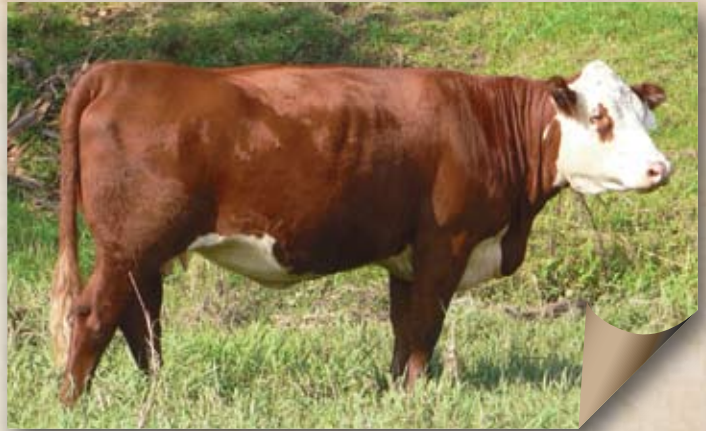
Lot 39 — AWPFF More Precious 233 F30P