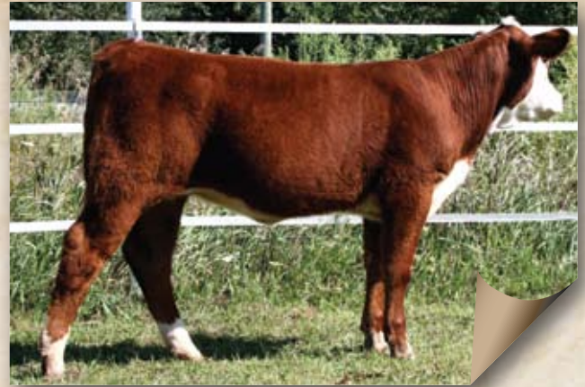
Lot 29A — PRR Simply Irresistable 15U