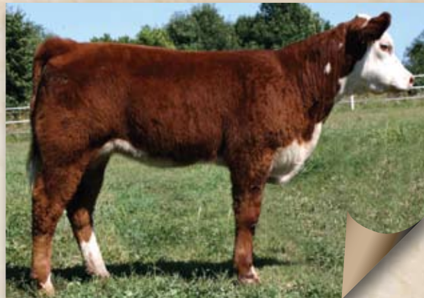
Lot 13 — PRR MAK Tamtam 25U