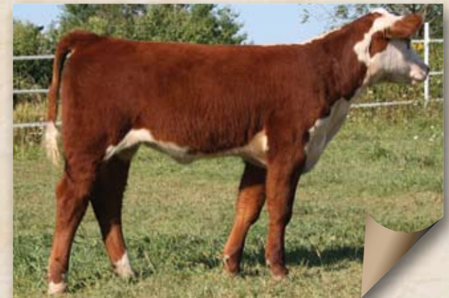
Lot 30A — PRR Cruella 37U