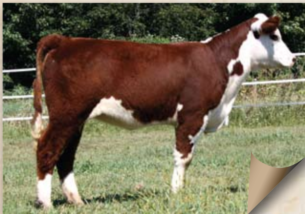
Lot 12 — PRR 254R Bonnie 32U