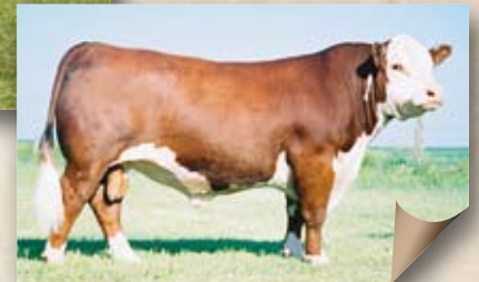
Sire of Lots 20A & B — BR DM Channing ET