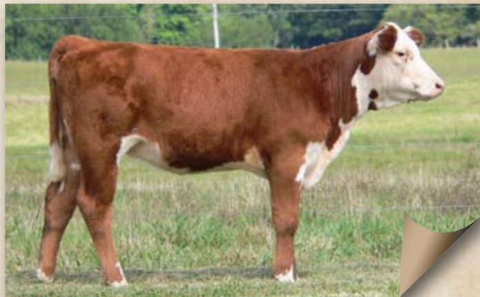
Lot 14 — PR 5115 Debra 8056