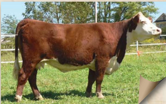
Dam of Lot 55 — PRR 29F Diamond 214