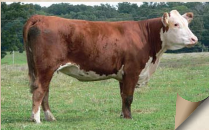
Lot 53 — PR M60 Lass 5094