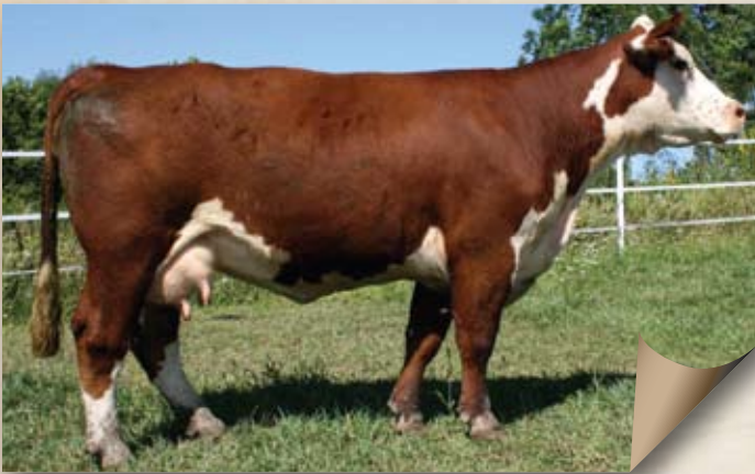
Lot 34 — PRR 313K Belle 3913