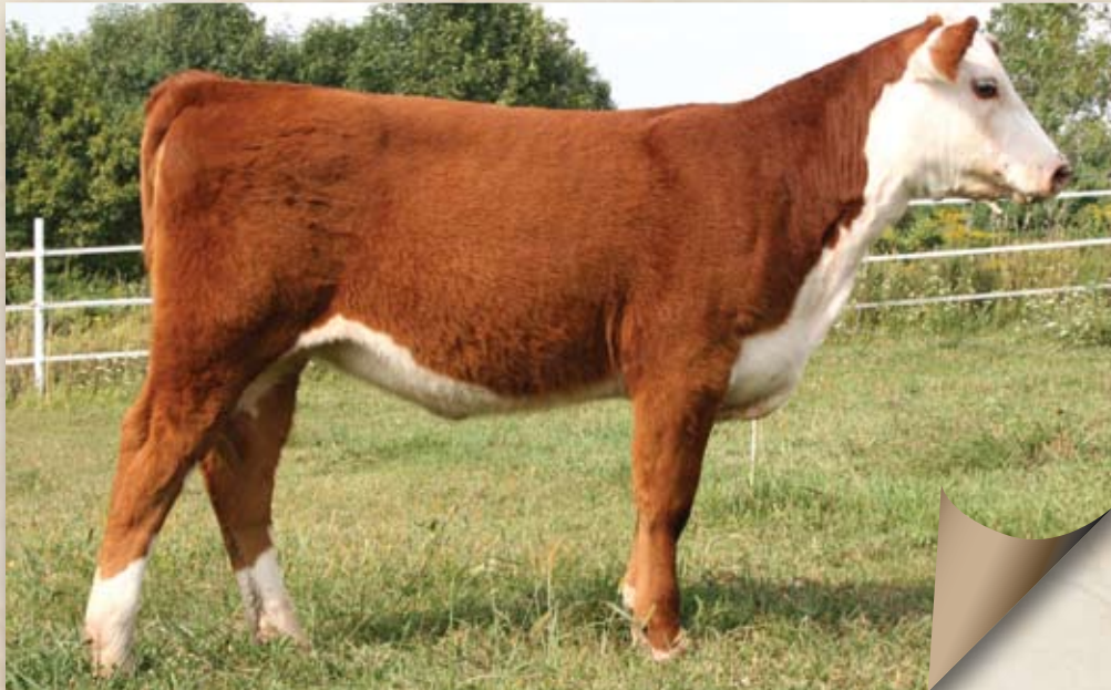
Lot 2 — PRR Hard Candy 29U