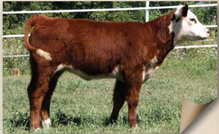
Lot 36A — PRR MAK KATHY 52U