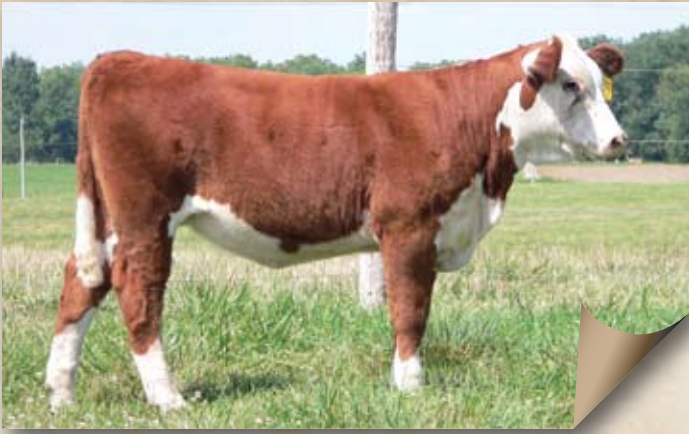
Lot 6A — PR 279R Annette 8032 ET