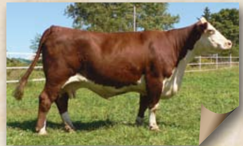
Dunwalke Pris E114