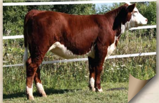
Lot 5B — PRR19U

Dam: BW 2.2; WW 30; YW 49; MM 21; M&G 35; FAT 0.00; REA 0.19; MARB -0.03