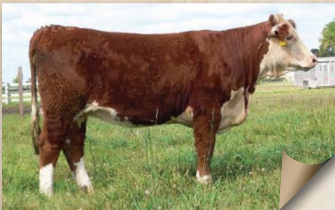
Lot 25 — PR M60 Lassy 7071