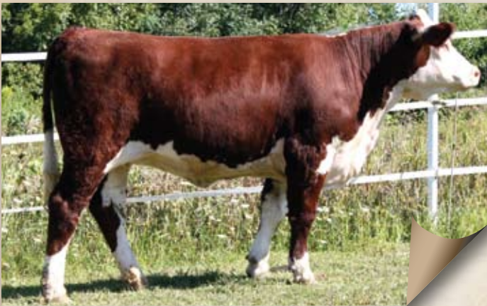
Lot 20A — PRR Chelsea 410T ET