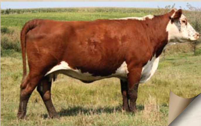
Lot 44 — THM 8045 Victra 1047