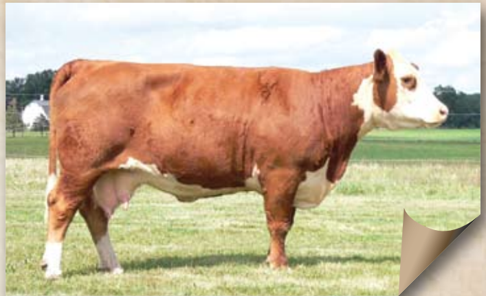
Lot 46 — KP Lady Supreme 202