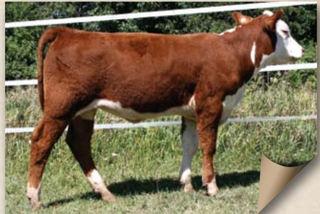
Lot 7 — PRR Classy Lassie 31U

• Classy Lassie is one of the few Chance heifer calves that we had this year. PRR Chance was a Reserve Division winner at the JNHE and a class winner in Louisville. The dam of 31U has been a very productive cow and is one of the oldest in our herd. That should tell you what we think of her and her abilities. Her maternal sister sells as lot 35.