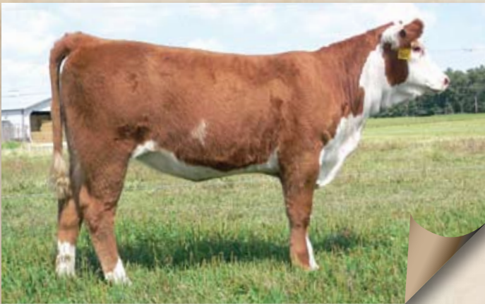
Lot 4 — PR 279R Daisy 8019