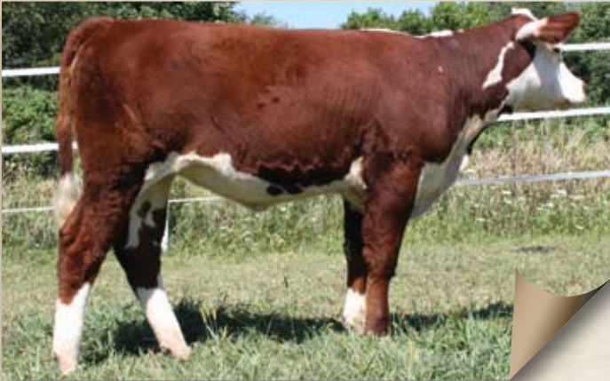
Lot 5A — PRR3U