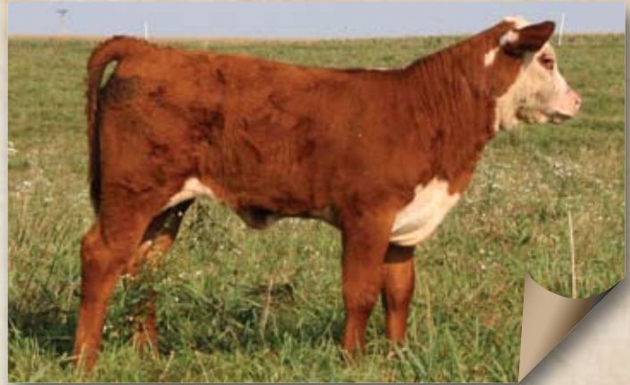
Lot 35A — PRR SUMMERTIME 42U