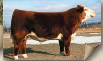
Sire of Lot 1 — LaGrand Reload 80P ET