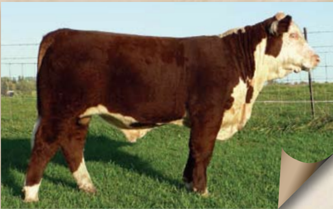
Service sire to Lot 42 and son of Lot 28 — PRR 002 Kenseth 47T