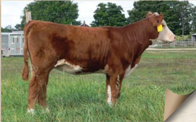
Lot 11 — PR 80P Raven 8040