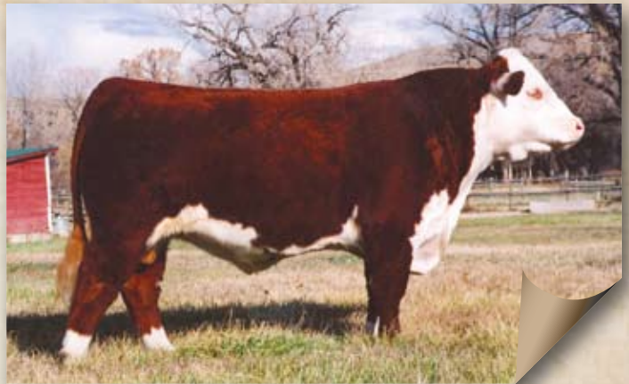
Sire of Lot 54 — NJW 28E Steeldust 102K