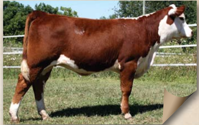
Lot 28A — PRR Chanel 12U

BW 3.5; WW 32; YW 50; MM 17; M&G 33; FAT 0.00; REA 0.14; MARB -0.02