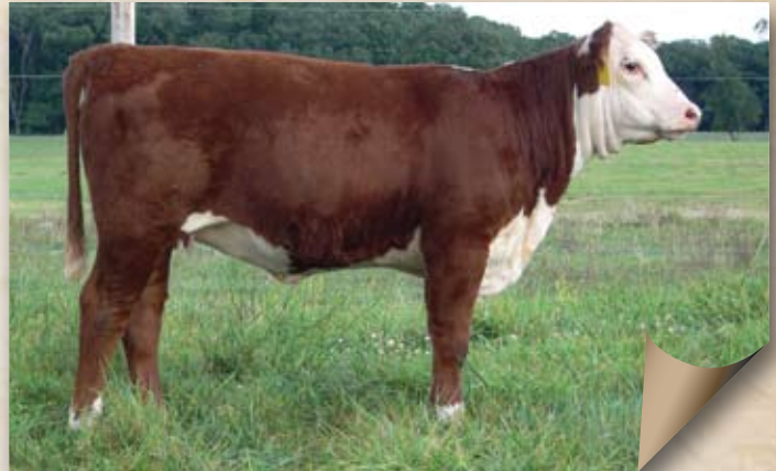
Lot 8 — PR 6002 Galena 8008

• Galena is the first Legend Killer calf to be born and the first to be sold. 8008 will not disappoint you either. She is out of a first calf heifer that has done a great job. 8008 is dark red and feminine. This heifer will make a top replacement or a really good show heifer.