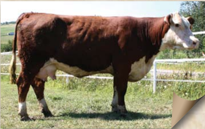
Lot 36 — FP Ms Grand Slam