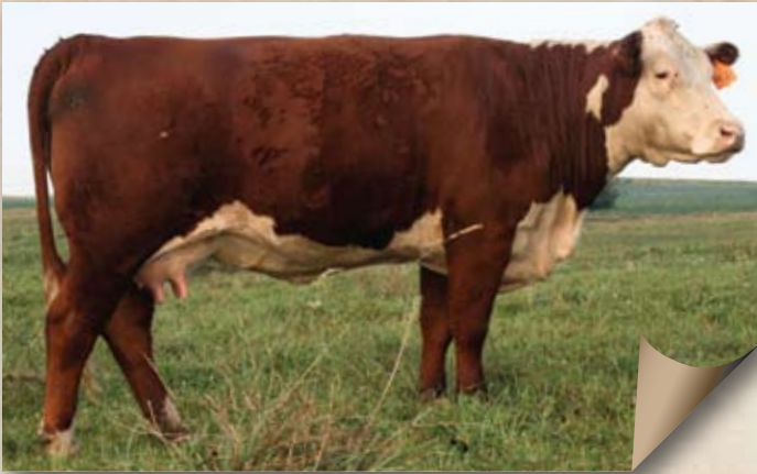
Lot 35 — PRR 313K Lizzy Mae 421P