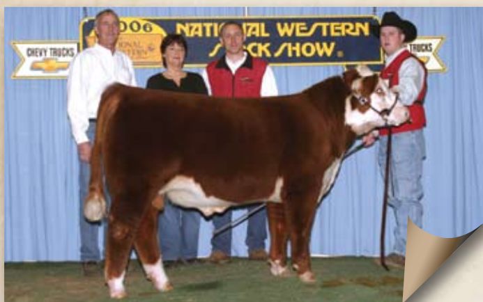
Sire of Lot 38's Calf — LCC 32M Cricket 553 ET