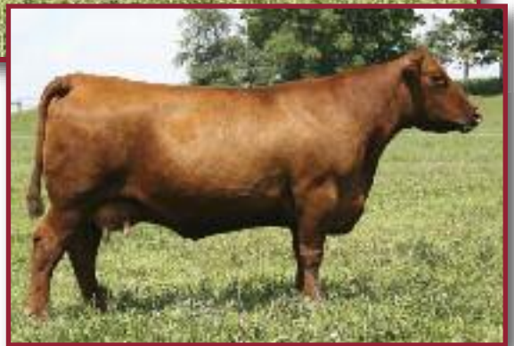
Red Brylor BJR Cherok 63J • Dam of Lot 7