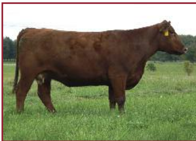
CJS Jody • Lot 53

Jody is young cow that has a great look to her. She is sired by an Advance son that we raised and out of a strong maternal cow family on the bottom side. She is very clean fronted, long bodied, and sound. 20 has done a great job for us in a short time. She is safe in calf to Express. Exposed from 6-6-2008 to 8-26-2008.