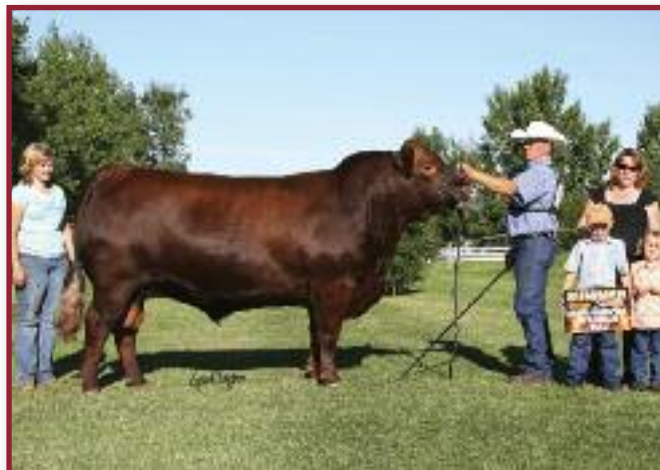
Red Brylor SDL Squall 230S • Service Sire to Lot 11

AI 4/8/08 Squall, Pasture exposed 5/5/08 to 6/16/08 RED Brylor Tahoe 207T.