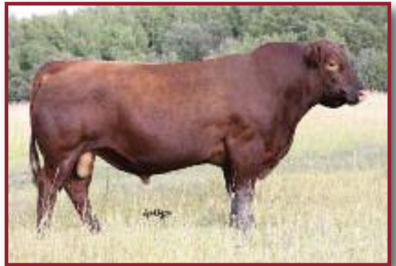
RED SSS Equal 508N • Sire of Lot 5

WOW, That is the word that is most commonly heard around here when visitors have stopped this summer. She has true power cow potential. Owned with Scott Graham in Canada. The natural 2008 heifer calf from one of the most commented on cows at the Fine Line dispersal. 22M was a $25,000 cow to WSF & Graham's. U22's sire sold for $7500 that day to Hamco in Manitoba.