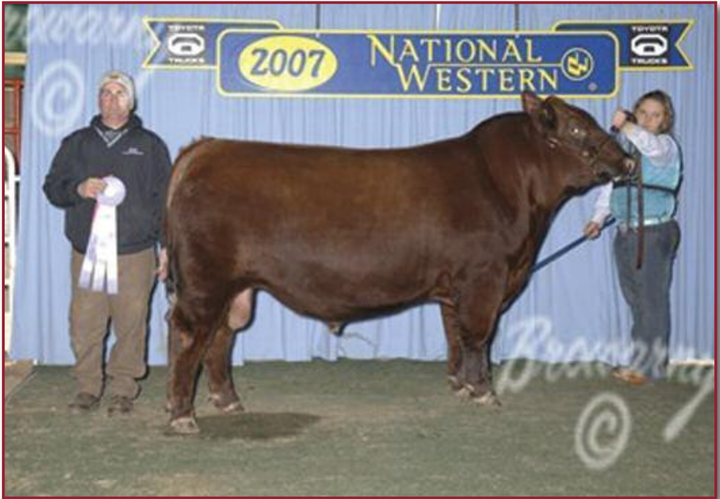
Badlands Loaded 25R • Sire of Lots 15-16