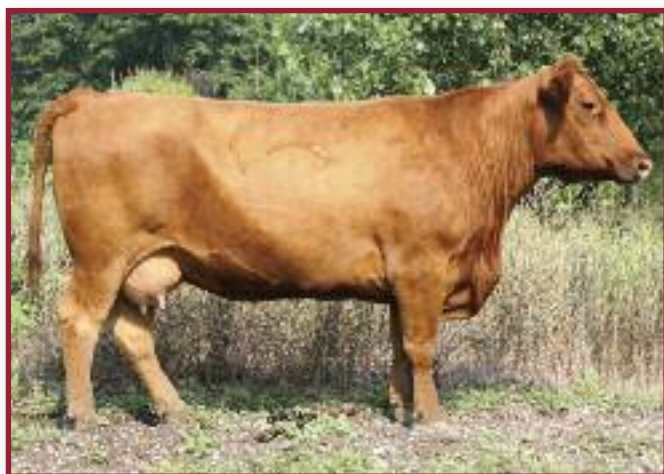
PIE Bonnie 9066 • Lot 19

AI 5/15/08 RED Brylor New Trend 22D, Pasture Exposed 5/19/08 to 7/6/08 RED Brylor Punch 33T