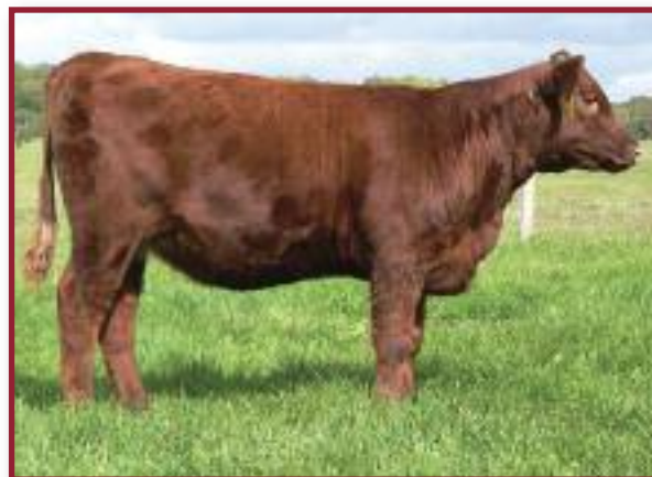
839U • Lot 33