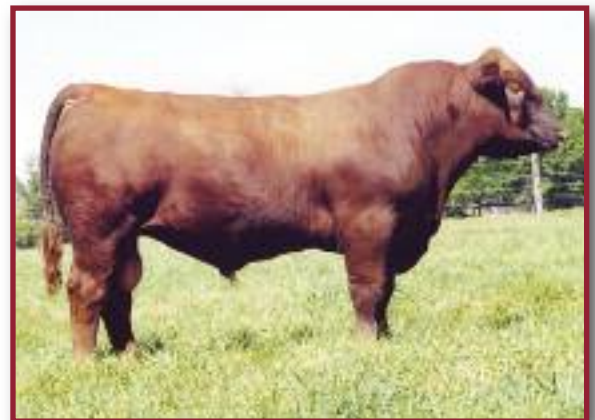
Perks Chateau 309R • Sire of Lot 3