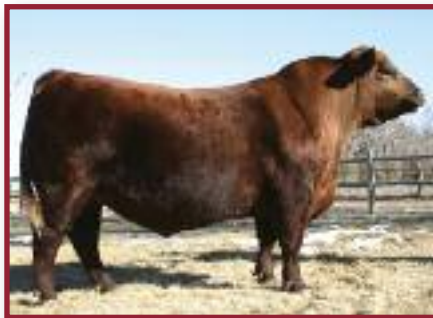
PIE Get Western 4061 Sire of Lots 31-32