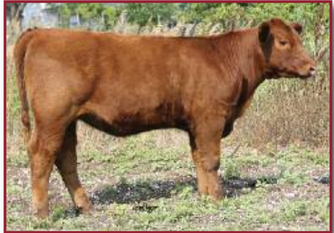
WSF Ms Bonne Bell U9066 • Lot 20

With the easy fleshing capacity and udder quality of her mother and the great bone and muscle from her sire, Badlands Loaded 25R, and her very balanced EPDs, this heifer will work in any program.