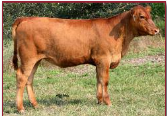
WSF Ms Mindi UN174 • Lot 22

Here is heifer sired by a red gene carrier black bull, Badlands Bando 5175-35S which goes back to the Cedar 624 cow. Outcross genetics in an attractive package, a win win.