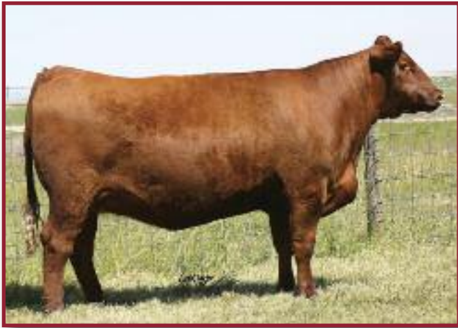
Red Brylor Olivia 2T Olivia 2T and Andra T105 (Lot 12) trace back to the Leachman Olivia cow family of the early '80s.