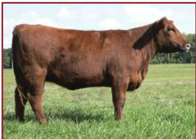
Perks Staress 710T • Lot 44

Sage is a front pasture cow. 705T is a Red Spread daughter that is going to be a donor for someone. She has as much volume and style as any cow that is going to be sold this year. She is out of a very good young cow that earns her keep. 705T was exposed to Kenworth from 5-9-2008 to 7-26-2008. Safe in calf.