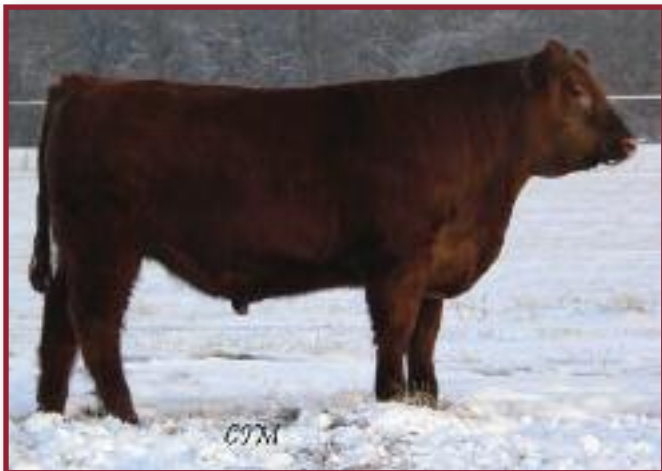
Perks Kenworth 723T (Reg. #:1166769)

Sire: LCC Cheyenne B221L Dam: Perks Princess 304R