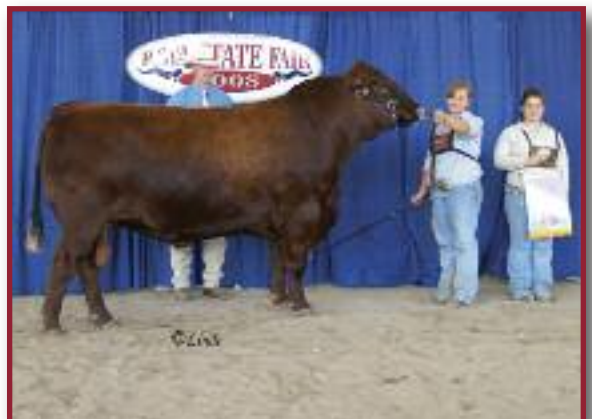
Red Brylor A L C Strong 116S Service Sire to Lot 4