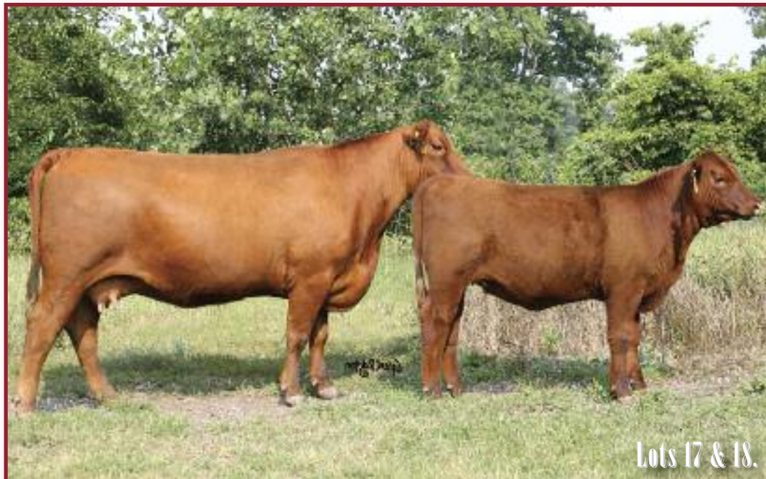
Lots 17 & 18.