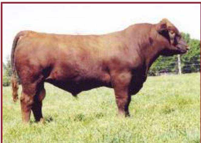
Perks Chateau 309R • Sire of Lot 14

AI 6/30/08 Karweik 1P, Pasture exposed 7/11/08 to 8/20/08 RED Brylor Tahoe 270T.