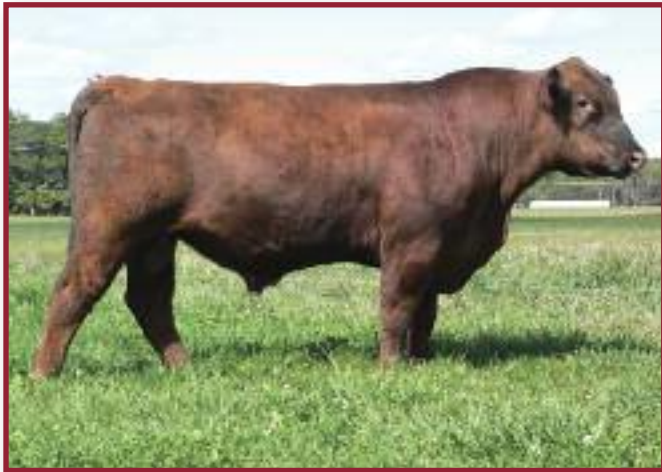
Perks Express 716T (Reg #:1166791)

Sire: PIE Express 5148 Dam: PIE Faye 4216