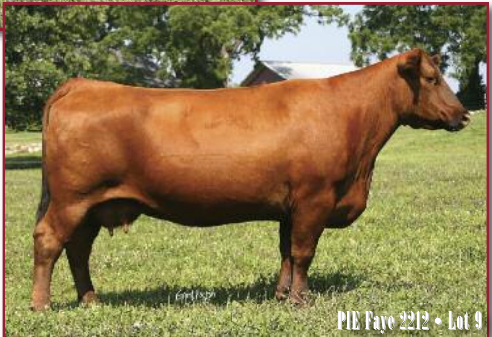
PIE Faye 2212 • Lot 9