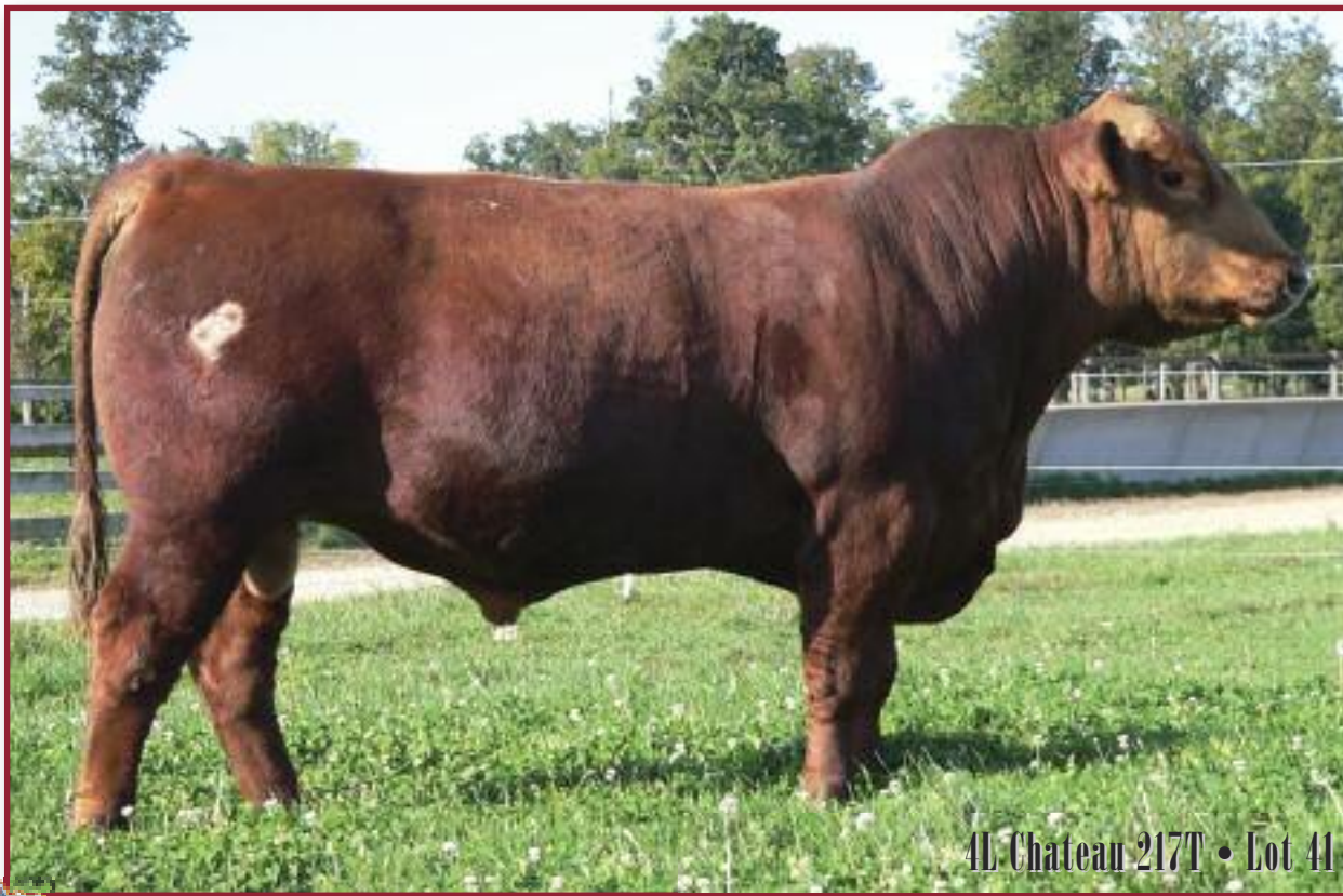
4L Chateau 217T • Lot 41