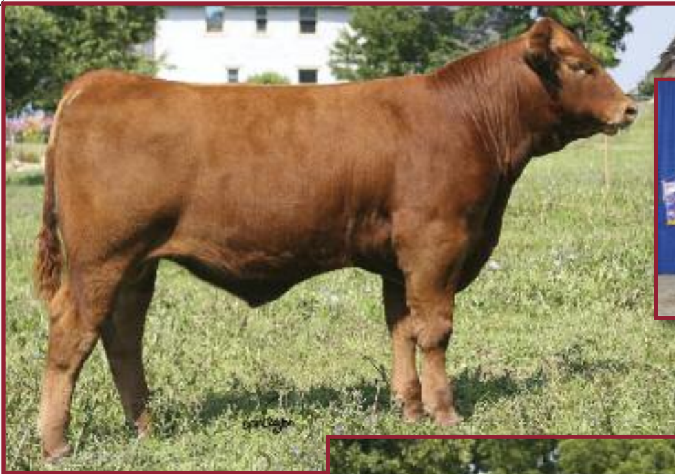
WSF Bentley U2212 • Lot 8