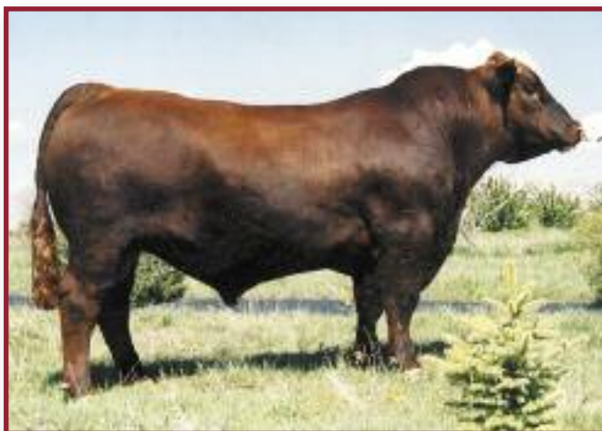
Perks Advance 121R • Sire of Lots 51 & 52

Princess is a high performance daughter of 121R that raises big, growthy calves. She has a nice udder and can get out and cover some ground. 524R is the type of cow that will raise a herd bull year after year. She was AI to Get 'R Done on 5-12-2008, then exposed to Hoss from 6-6-2008 to 8-26-2008. Safe in calf.