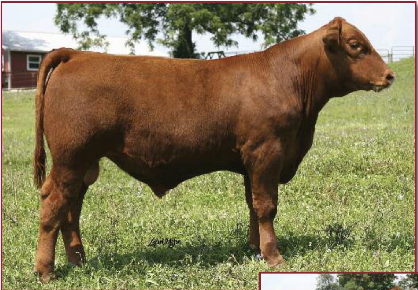
Red Brylor/WSP Cherok U63 • Lot 7