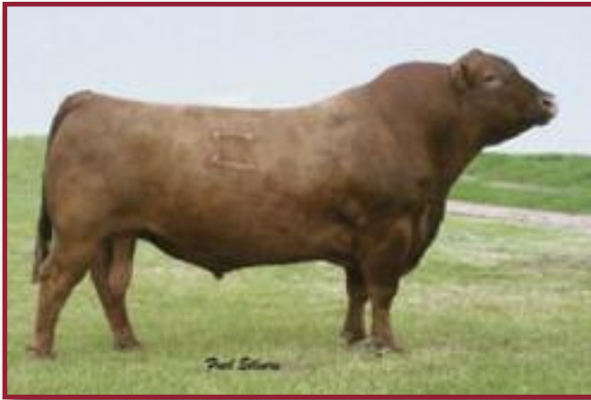
BJR Monu 4X-303 • Sire of Lot 49