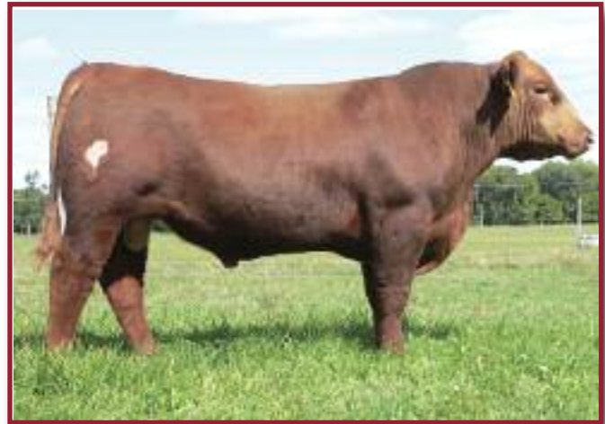
Perks Powerade 717T (Reg. #: 1166799)

Sire: PIE Express 5148 Dam: PIE Faye 4216