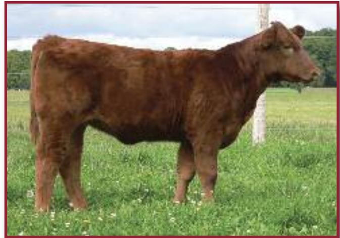
Perks Miss Grand Roll 869U • Lot 40

HOLDEN HI ROLLER 8106 HOLDEN HI HO 574 | BW 79 lbs. FORSTER HI ROLLER 0142 BIEBER MIMI 4151 FORSTER COPPRQUEEN 7179 PBC D0202 6M H0904 | BR 98 MISS FORSTER CPRTOP 591 UBAR GRAND PRIX 102 LCHMN GRANDCANYON 1244G PERKS MISS GRAND PRIX 405R FORSTER COPPRQUEEN 7168 PERKS MISS ADV 020R RBJR ADVANCE A709 PJMC MS BAD JOHN 108