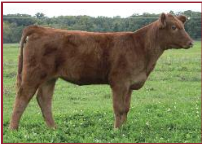
Perks Miss ADV 863U • Lot 39