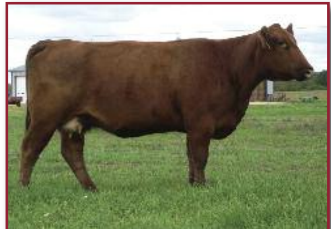
Perks Miss Advance • Lot 48