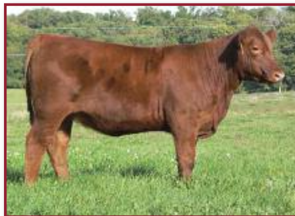
Perks Princess 814U • Lot 36

BUF CRK VALENTINO N031 WR MR. RED DAWG 5335 TMAS MS FORTUNE 114