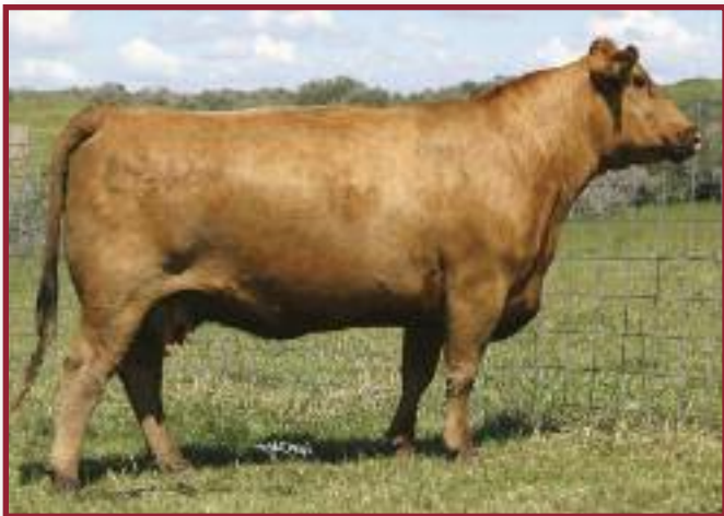
RED Bonny 7468 • Grand Dam of Lot 13

AI 5/3/08 Squall, Pasture exposed 5/5/08 to 6/16/08 RED Brylor Tahoe 207T.