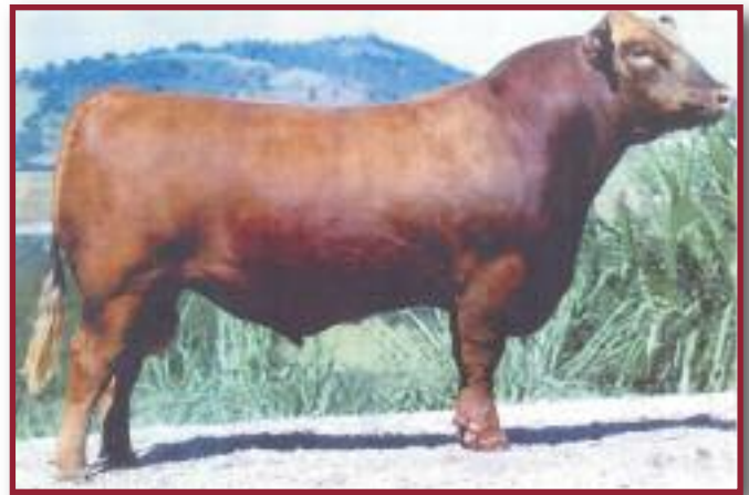
UBAR Grand Prix 102 • Sire of Lot 45