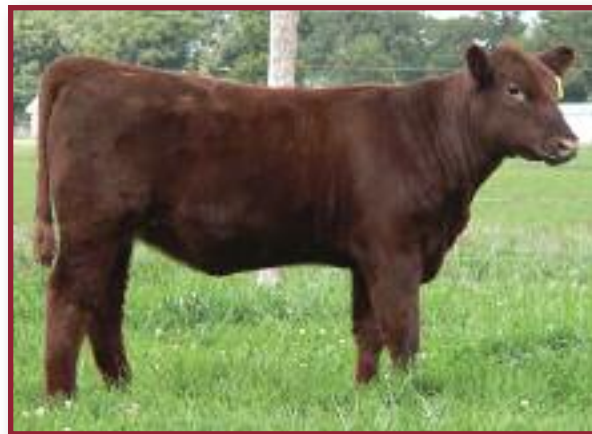
841U • Lot 34

PIE CHICAWA 366 PIE GET R DONE 684 PIE RED RUBY 4094