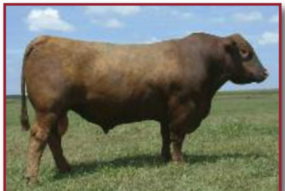
Red LCC New Chapter A705L • Sire of Lot 7