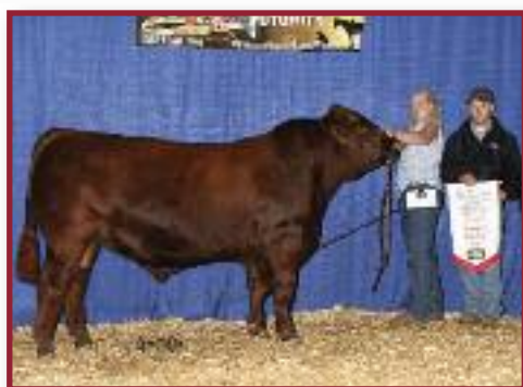
Reserve Grand Champion Bull, 2nd Leg of World Angus Forum in Canada.