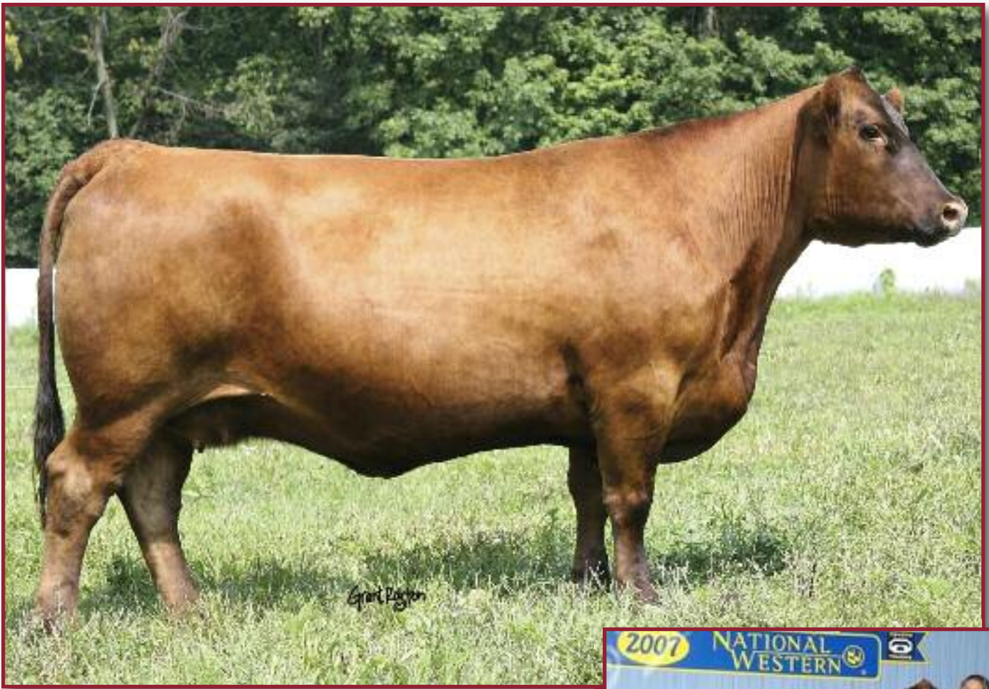
HCFA Ms Stonny 209 • Lot 4 (Co-Owned with Sand Point Cattle Company)