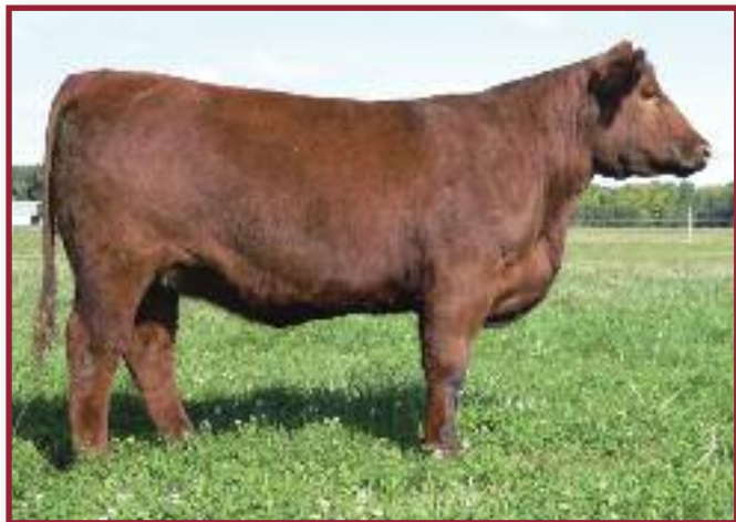
Perks Red Princess 718T • Lot 42