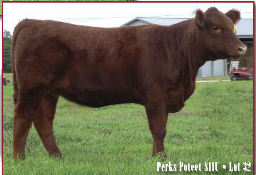
Perks Poteet 811U • Lot 32