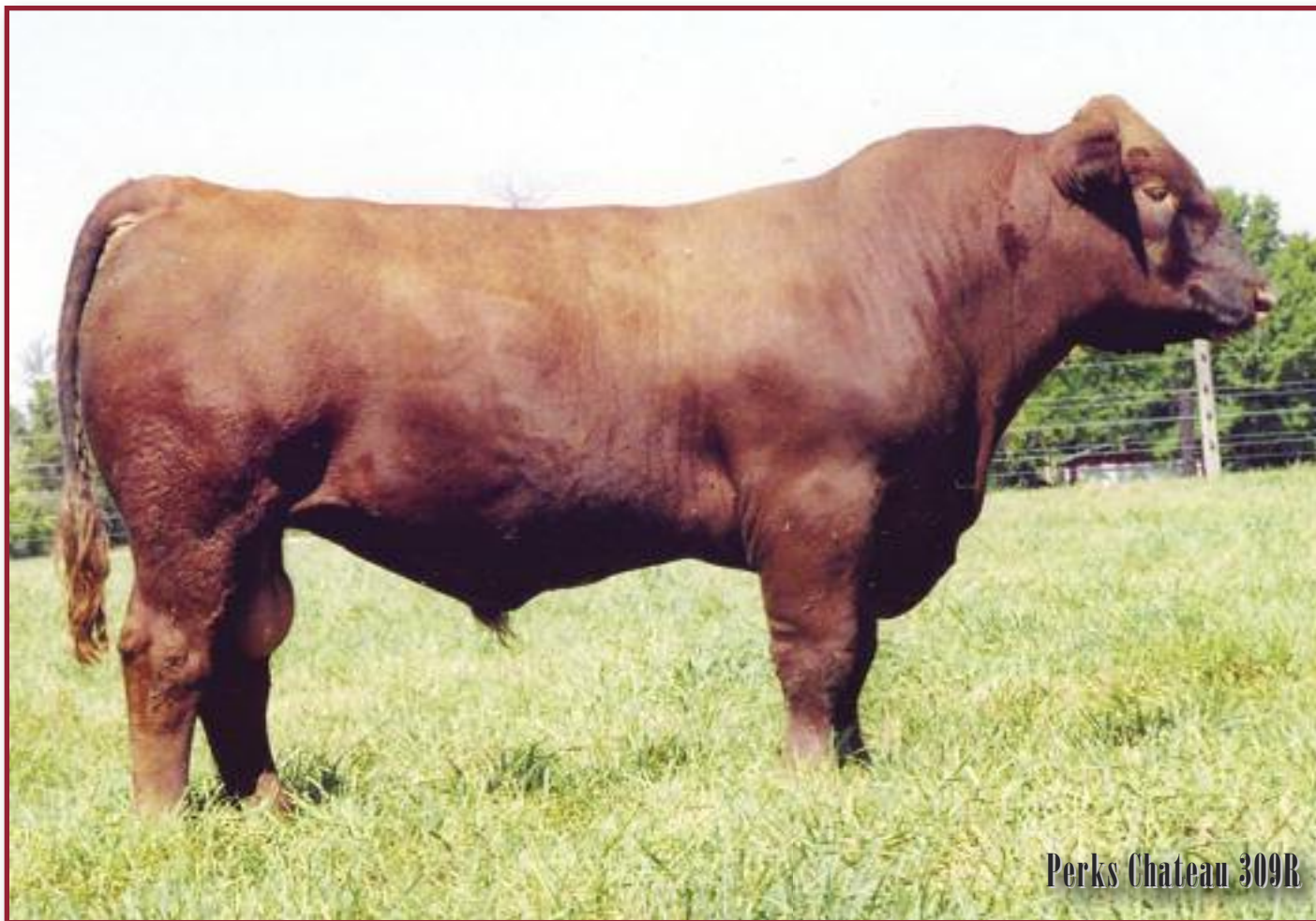
Perks Chateau 309R