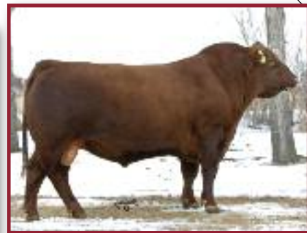
Red Brylor Bodasius 79K