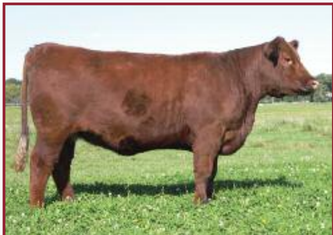
Perks Sage 705T • Lot 43

POWER. STYLE. Red Princess is an A709 that can run with the best of any breed, thankfully she is a Red Angus. She is as thick and deep as you would expect, seeing that she goes back to Red Spread. She was exposed to Powerade, our Grand Prix grandson, from 4-26-2008 to 7-26-2008. This cross is going to be deadly. This is a donor prospect. Safe in calf.