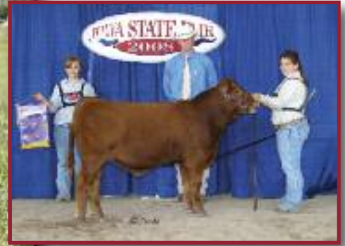
Champion Jr. Bull Calf Iowa State Fair