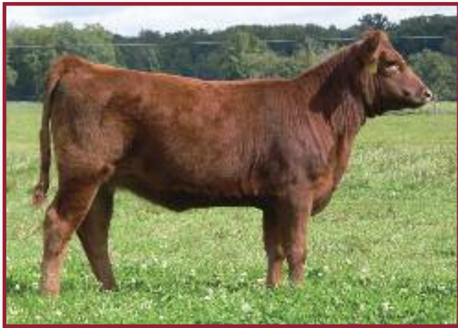
Perks Lola 840U • Lot 38