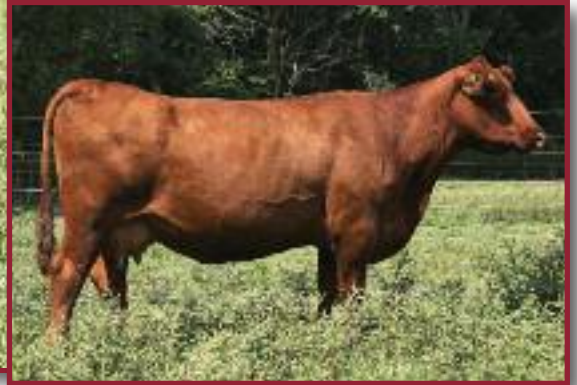
RED FL Aster 22M • Dam of Lot 5