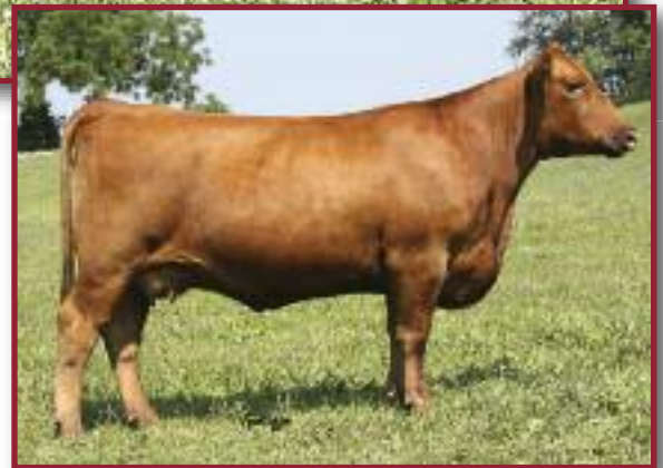
WSF Ms Maria 209 S3 • Dam of Lot 3

One of the classiest, most upheaded, sweet made heifer calves to come along. From the famous Stony family, she's bred to be noticed. Her dam is an excellent New Trend 1st calf heifer with that perfect udder and athletic build. She will be on display with her calf at the sale. Her grand dam, Stony 209 is also in the sale as lot 4.