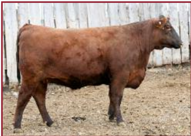
Red Hamco Crocus 113S • Dam of Lot 6

A very unique blend of High Capacity 800M/New Trend 22D and just good ole fashioned cow sense. Mike gave $4500 for the dam as the high selling bred heifer in the 2007 Manitoba Magic All AI'd sale last fall and U113 is what she was carrying. High Capacity was a $21,000 bull at Brylor's '04 bull sale. He's a paternal brother to High Capacity 224 and Sequoia.