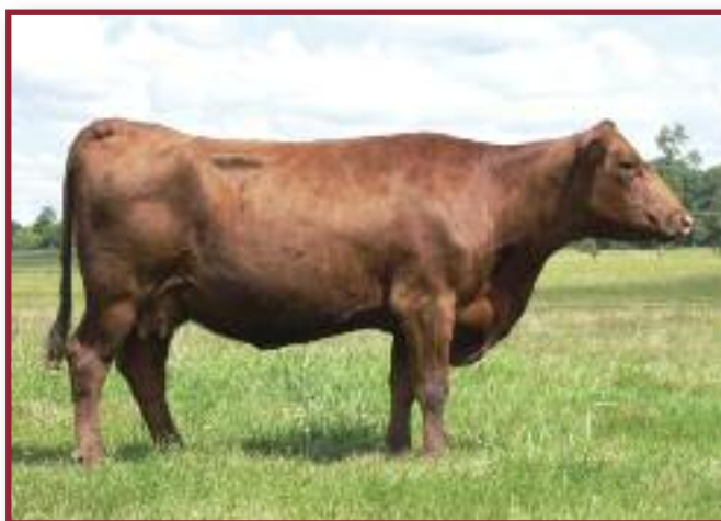
SRN Prilark 4090 • Lot 54

4090 is as maternal as you can find one. She goes back to some of the most prolific cows in the breed, such as Reba's Robin and Leachman Prilark. 4090 has a beautiful udder and great disposition. This is a cow that could be a donor for somebody. She was AI to Red Spread on 5-31-2008, then exposed to Express from 6-6-2008 to 8-26-2008. Safe in calf.