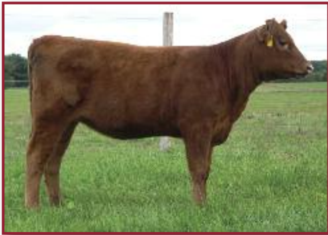
Perks Kitty 834U • Lot 37