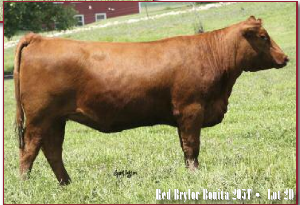
Red Brylor Bonita 205T • Lot 2D

These Mulberry 26P daughters are outcross females with a powerful genetic package that will push forward any breeding program.