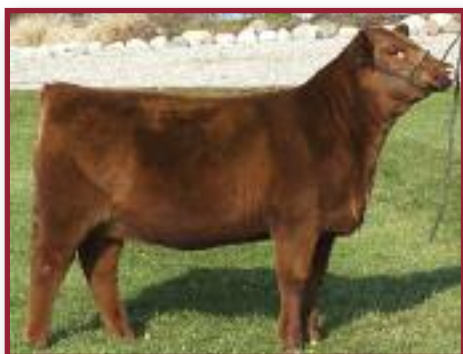
WSF Ms Chateau Spring 0258R