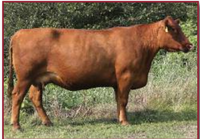
WSF Razy Girl 174 • Lot 21

AI'd to 5/15/08 RED Fine Line Mulberry 26P, Pasture Exposed 5/19/08 to 7/06/08 to RED Blyor Punch 33T.