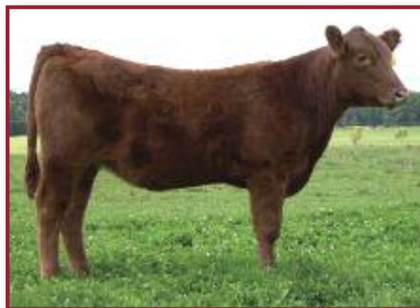
Perks Princess 808U • Lot 35

BUF CRK VALENTINO N031 WR MR. RED DAWG 5335 TMAS MS FORTUNE 114