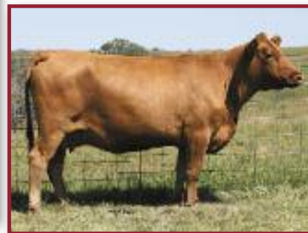
Red Raven River Rebello 28M