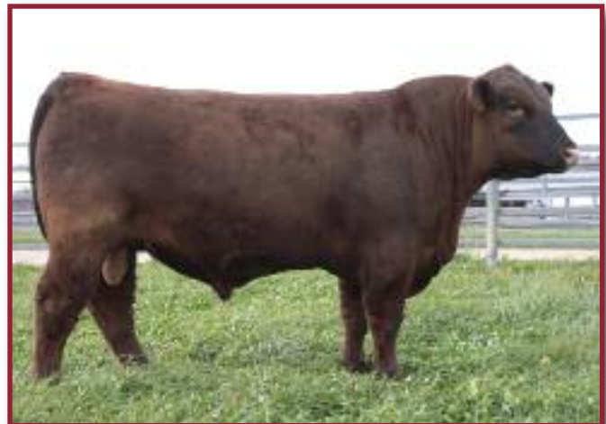
PIE Hoss 5241 (Reg. #: 1062984)

Sire: LCC Cheyenne B221L Dam: Perks Princess 304R